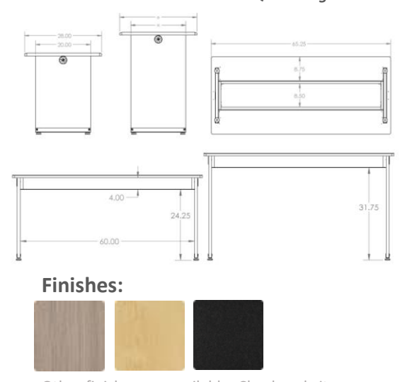
Other finishes are available. Check website.

The information contained in this drawing is the sole property of Audio Visual Furniture International. Any reproduction in part or as a whole without the written permission of Audio Visual Furniture International is prohibited. We can build or modify stock configurations to suit customer specifications. Please contact us to discuss how this service can help meet your needs. Some quantity restrictions may apply. Specification subject to change without notice, Computers, cameras, monitors, etc. are shown to illustrate product usage and are not included unless otherwise noted.